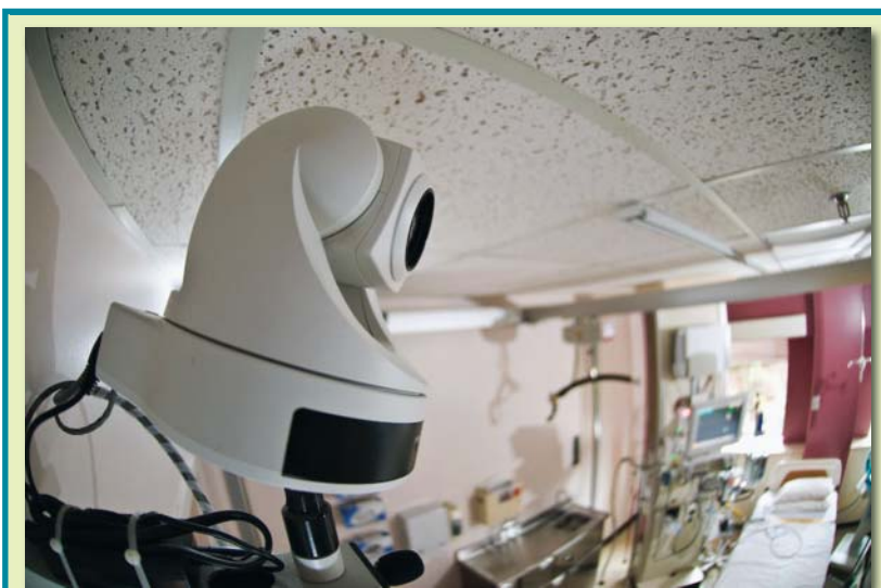
Figure 1 High-resolution cameras with zoom and pan ability are mounted in each room in the intensive care unit, enabling the tele-ICU staff to assess patients and/or communicate directly with the bedside team.

Although the technology is relatively consistent from one tele-ICU system to another, program staffing models vary according to the needs of the hospitals within the system and the availability of resources. The "typical" tele-ICU operates 24 hours a day, 7 days a week and is staffed with critical care nurses and support staff with the intensivist on site 15 to 20 hours a day. 21 In some programs, the intensivist works only the off-shift hours when on-site physicians have signed out to the on-call system. Replacement of tele-ICU registered nurses (eRNs) by midlevels such as nurse practitioners or physician assistants is another option for the model (Shawn Cody, VISICU operations director, oral communication, monthly teleconference, August 2007). The mean ratio is about 60 to 125 patients to 1 tele-intensivist, 30 to 40 patients to 1 eRN, and 50 to