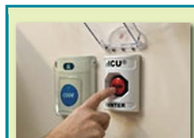
Figure 2 VISICU eLERT button allows staff in the intensive care unit to request the on-camera presence of the tele-ICU team. Both 1-way and 2-way audio/video communications are available for tele-ICU use.

Tele-ICU physicians (ePhysicians) are board-certified/board-eligible intensivists, privileged and credentialed in each participating hospital, who provide oversight and intervention as appropriate for patient safety or as requested by the attending physician. A few programs employ a full-time ePhysician, but most programs have physician rotation schedules. When a program has more than 125 patients, the need for additional ePhysicians may need to be revisited. 22 Challenged by the shortage of intensivists, some programs provide additional coverage with specialists such as cardiologists